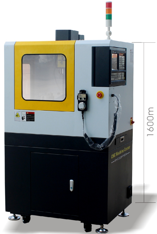
Optional Colour and Base

The VMC200 is a 3 axis small CNC machine center, available either floor standing or for bench mounting, with high performance 3 axis milling CNC controller, support multi language interface display, the standard spec includes MPG hand wheel. Selection of high -quality casting materials, High-precision linear guide and ballscrews, semi-automatic lubrication system, protect the rail life. 5 tools automatic tool change system (ATC), ISO20 spindle type, frequency conversion water cooling spindle motor, low noise, 24000rpm spindle supreme speed. Standard spec XYZ axis is stepper motor, option AC servo motor. with the option of flood coolant with industrial cabinet base and and automatic aligning instrument. Ideal for cutting a range of resistant materials such as wax, plastic, acrylic, free cutting alloys, aluminium and steel. Recommended software programs (MasterCAM, UG, Fusion360, SolidWorks). Suitable for technology development, advertising design, art, ocational technical college Education & Training CNC and DIY enthusiasts.