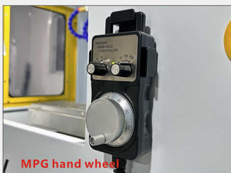
MPG hand wheel