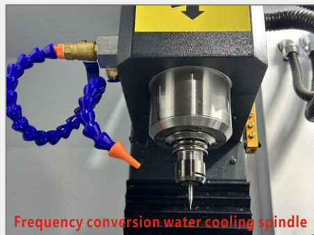
Frequency conversion water cooling spindle