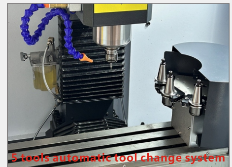
5 tools automatic tool change system