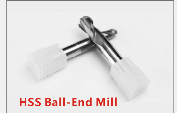
HSS Ball-End Mill