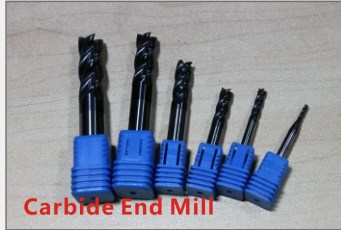
Carbide End Mill