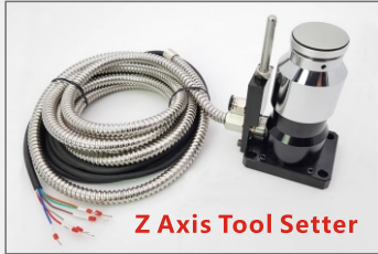
Z Axis Tool Setter