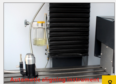
Automatic aligning instrument