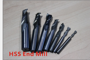
HSS End Mill